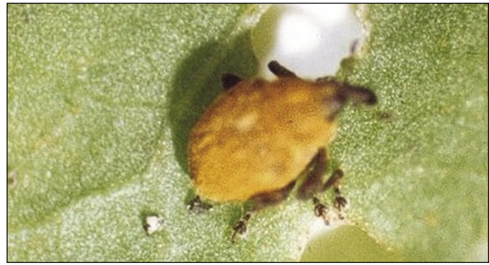
An adult weevil, Rhinoncomimus latipes, has been released as a biological control agent against mile-a-minute weed in New Jersey and Delaware.

Glyphosate applied at a low rate will probably be effective in killing mile-a-minute weed. Prior approval and recommendations should be obtained from the department of agriculture in the state where the application will take place.