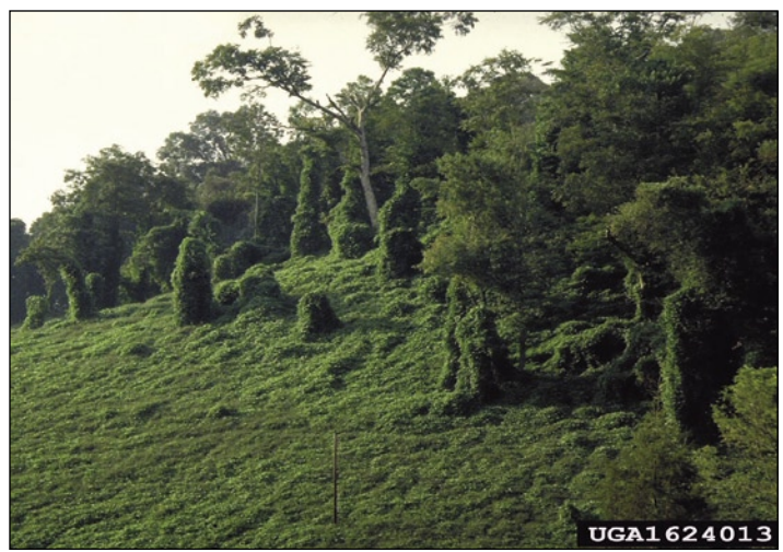
Dense mats of mile-a-minute weed (Polygonum perfoliatum) overgrow a forest edge completely covering other vegetation.