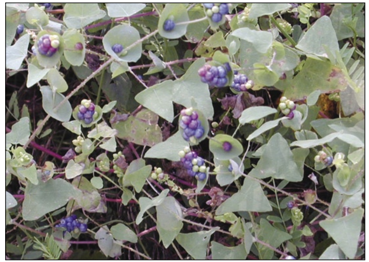
Triangular leaves, recurved barbs, and numerous bright blue fruits make mile-a-minute weed easy to identify.

Mile-a-minute weed varies in height depending on habitat. In open areas, dense mats are formed covering everything including small trees and shrubs. At forest edges, plants climb on other vegetation reaching up to 8 m in height. The light green, triangular leaves, 4 to 7 cm long and 5 to 9 cm wide, are alternately arranged along the stem. The stems are green, turning reddish with age and becoming woody near the base. The main veins, petioles and stems have sharp, recurved hook-like barbs. The ocrea, a saucer shaped sheath 1 to 2 cm in diameter encircles the node. The inflorescence is a spike-like cluster of 10 to 15 tiny white flowers. The fruits resemble blueberries and are 5 mm in diameter. arranged in clusters. Each fruit contains a single round, shiny-black achene. Annual plants have shallow, fibrous roots. In the eastern United States, mile-a-minute weed germinates in full sun in early spring, flowering begins in