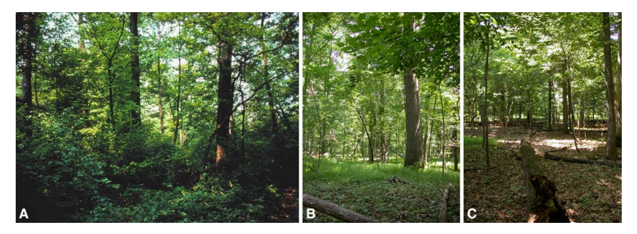
Fig. 1 Time series of photos from Hutcheson Memorial Forest (HMF) in Somerset County, New Jersey. HMF is mixed oakhickory forest with 26 ha of old growth surrounded by secondary forest, old fields, and farm fields. (a) Shows the forest in 1976 with an intact shrub layer. Overbrowsing by deer and non-native plant invasion have changed the forest understory and midcanopy from native saplings, shrubs and

This newly created structure and composition appears to be persistent thus forming what Royo and Carson (2006) term a recalcitrant understory. These authors suggest that a recalcitrant understory has at least one of following attributes: (1) the understory exists as a denser and more extensive ground cover, and has lower diversity, as compared to the historical understory, (2) it can alter the path and rate of succession by outcompeting tree seedlings for light, and (3) once established, the understory layer can repel potential invaders and can persist for several decades. In mid-Atlantic deciduous forests, normal successional pathways are stalled by the recalcitrant understory composed of stilt grass and maintained by deer overbrowsing (Pedersen and Wallis 2004). Stilt grass crowds out competitors,